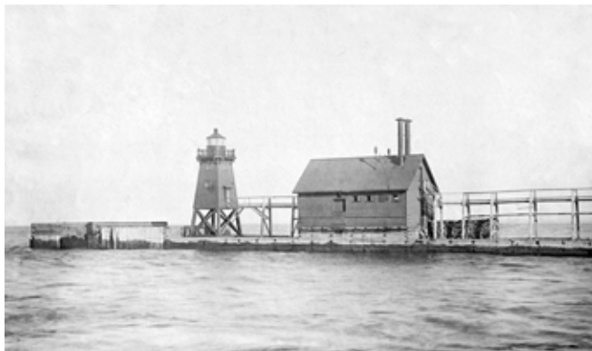
Duluth South Pier Front Lighthouse in 1893.