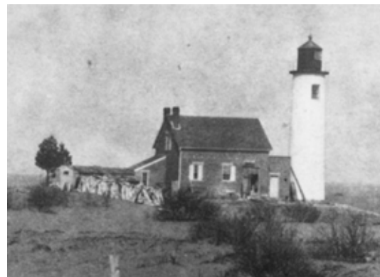
The Minnesota Point Light house and Keeper's house c.1870s.