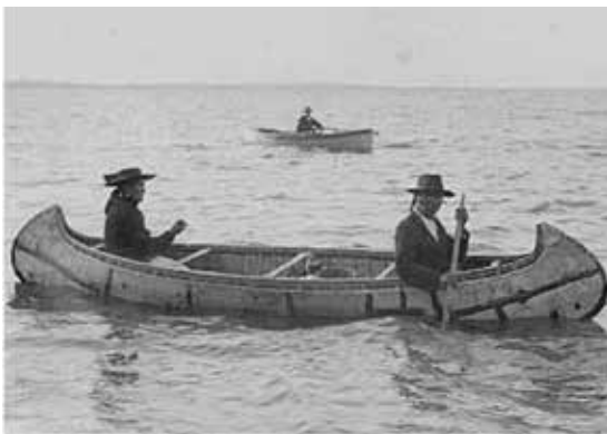
Anishinaabe birch bark canoe c.1910.