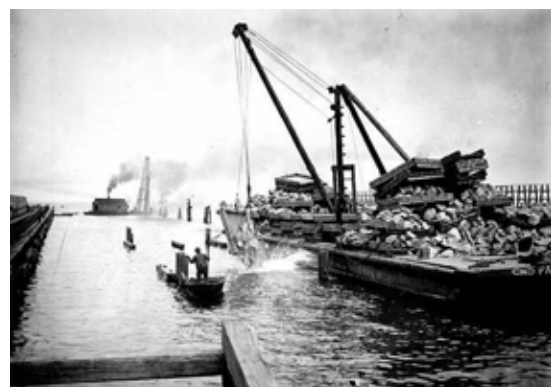
Rocks dropped from loaded barges into the water, Duluth ship canal c.1900.