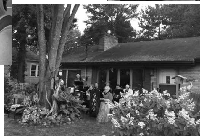
Big Water Blue Band at 18th street