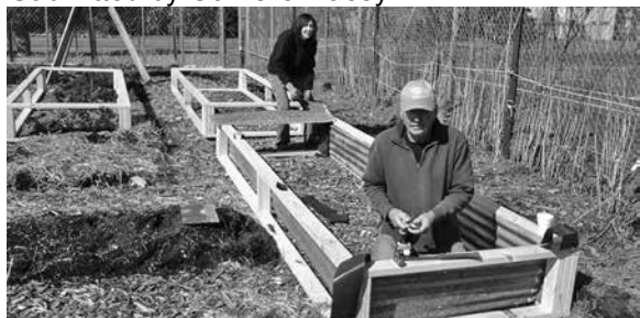
Starting on new beds from old boathouse metal!