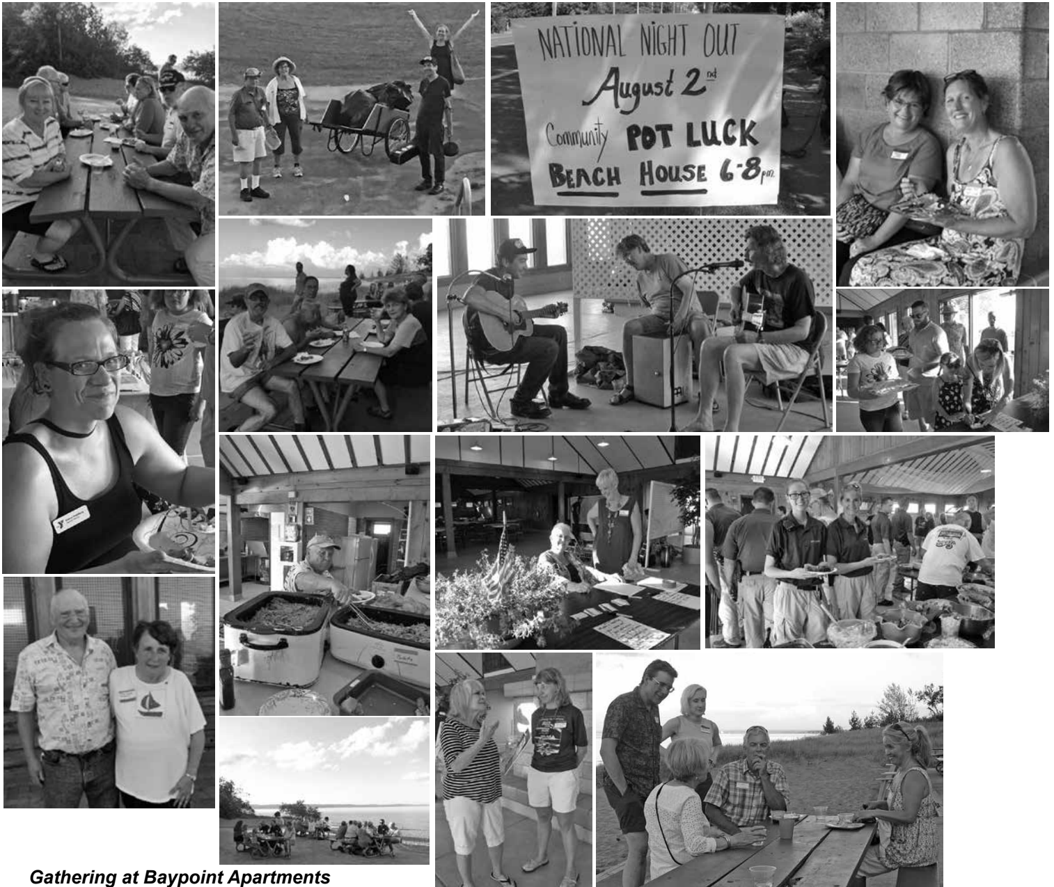
Gathering at Baypoint Apartments