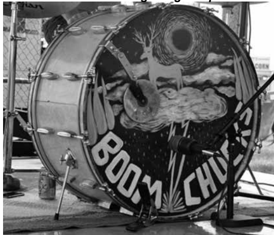
Boomchucks sounded great!

Park Point Art Fair 2016 went off with a bang! The Fair was a success, with artists reporting good sales and the Community Club profiting more than anticipated. I particularly enjoyed the music, art making activities, strolling musicians and the cooperative painting duo from Bagiry Studios. The art work was of stellar quality, with a nice mix of returning and new artists. KUMD switched up their programming this year, creating a tent lounge where fairgoers could color, recline in couches and listen to tunes. The only complaint would be the wind and lightening.