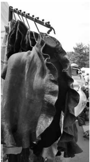
Fiber art booth