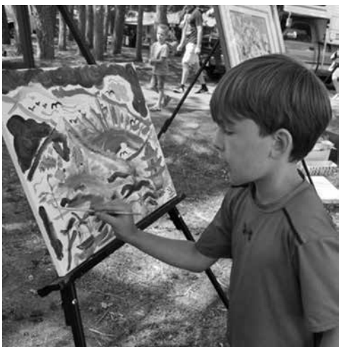
Cooperative painting with Bagiry Studios