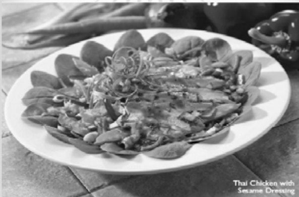
Thai Chicken with Sesame Dressing

Due to the overwhelming responses to Eating Fit, it is now going to stay on the main menu! Enjoy the flavors of Green Mill and be true to your commitment to eat healthy. Counting fats, calories or even dietary fiber? The Green Mill Eating Fit menu features healthier alternatives - many that meet the requirements of today's most popular diets.