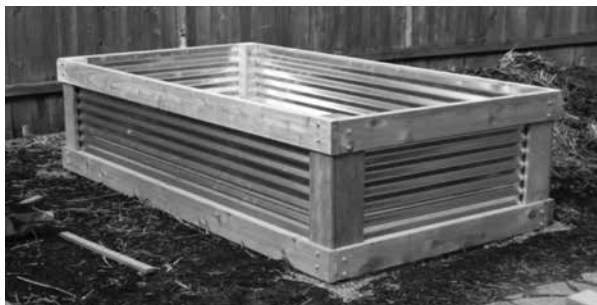
Proposed new metal-sided raised garden beds for the Lafayette Community Edible Garden.