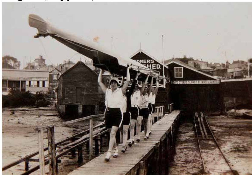
YWCA women's rowing team carry their boat from Gardner's Boat Shed, Australian National Maritime Museum