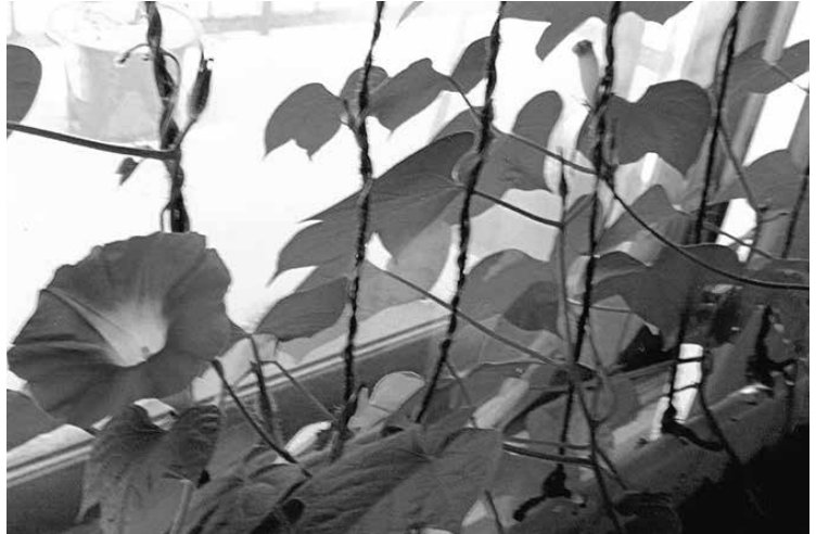
Proof you can grow summer flowers in winter.

The vigorous plant has attached its vines to a half-dozen, five-foot long strands of twine anchored in a tray of soil on the bottom and curled around the drapery rod on the top.