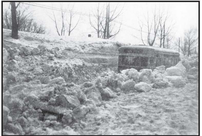
When these pictures of one of the first buses through were taken, the sun had greatly reduced the height of the drifts. Notice chimney and telephone cables in the background.