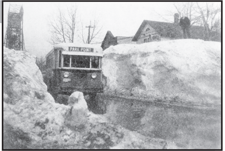
A week after the storm, when the city plows aided by the power of a shovel at some of the hardest drifts, finally got Minnesota Avenue open. Notice the man standing on top of a drift.