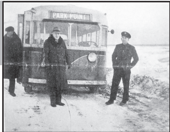
One of the first buses to make the run on the frozen beach of Lake Superior where the gale had swept the ice almost clear.

The Gas Buses proved themselves on Park Point a few weeks ago. When the snow blew in off the lake, so that cars were stalled on Lake and Minnesota avenues and buried four or five feet deep under a mixture of hard packed snow and sand, it was almost a week before a one way lane could be opened up through the drifts. But Park Point residents were not tied up at home for that time. With the help of a power shovel at some of the deepest, hardest drifts, the Public Works Department managed to get a plow through from the south approach of the Aerial Bridge, to the lake shore and along the beach until they were stopped by the great granddaddy of drifts which extended well out on the ice of the lake at about 38th street. The sturdy little gas buses followed the plows, bumping over the icy snow and frozen sand, but getting through. Residents of the Point who had been storm-bound for two days, were able to lay aside the snow shovels they had been using to tunnel out from their front or