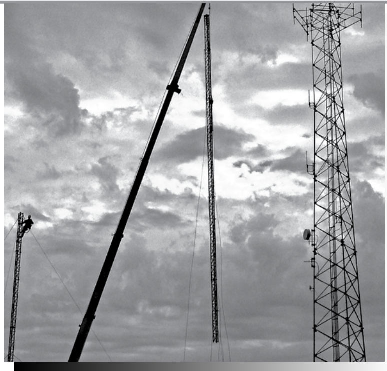
This picture shows the top section of the old tower being lowered by crane. Demolition began after five antennae were moved to the new tower, right. The towers are 135 ft tall; the man on the left is about 75 ft up.

Michigan beach grass was imported from Michigan to revegetate the dunes, since there was no local source to purchase from. A study by a UMD grad student showed that the Michigan strain and the local strain were quite different. The local type is smaller, and infrequently will have small seed heads. The imported type is very robust, almost twice as tall as the local type, and has prominent long seed heads that are produced into the fall. Are you wondering what it looks like? This is the best time for distinguishing it from the local beach grass. Look for taller plants with even taller seed heads at many of the most-used beach accesses.