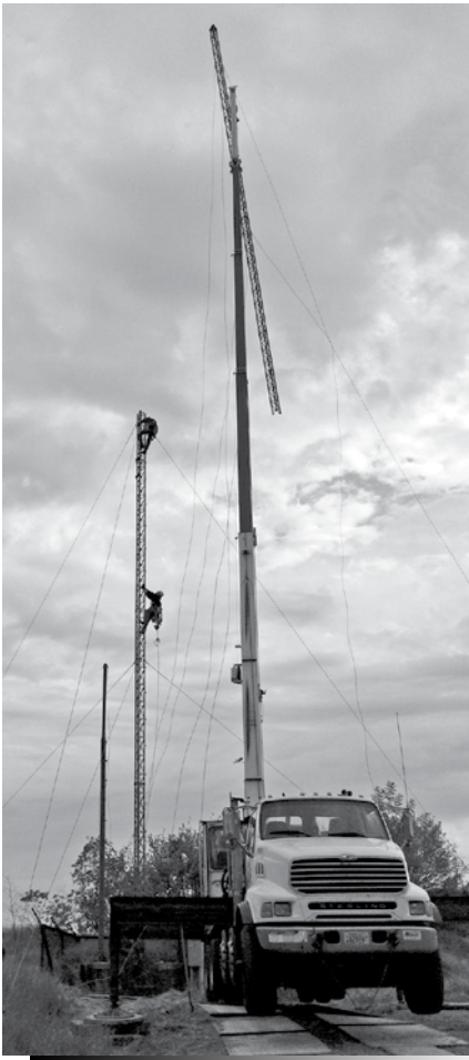
The first tower which was built in the 1930s, fell in a storm in late 1949. This second tower was built in 1950 and torn down on September 27, 2013.

Plans are being made for the week of October 14th. Watch the S-curve for times and dates!