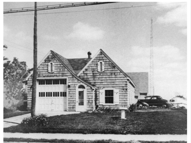
Fire Hall #5 as it appeared in the late 1930's. Not much different, really.

A. Reinhold Melander —who designs include St. Luke's, St. Mary's, and Miller-Dwan Hospitals as well as First Lutheran Church and St. Scholastica's Somers Hall and Science Building—crafted the building to fit in with the architecture of the surrounding neighborhood. His simple wood-frame structure was semi-residential and sided with grey cedar shingles and cost just $5,050, including the property (about $73,000 today).