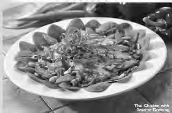
Thai Chicken with Sesame Dressing

Due to the overwhelming responses to Eating Fit!, it is now going to stay on the main menu! Enjoy the flavors of Green Mill and be true to your commitment to eat healthy. Counting fats, calories or even dietary fiber? The Green Mill Eating Fit menu features healthier alternatives — many that meet the requirements of today's most popular diets.