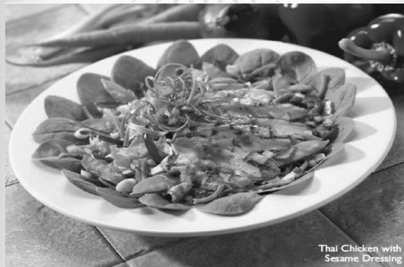
Thai Chicken with Sesame Dressing

Eating fit! A healthy serving of healthy servings