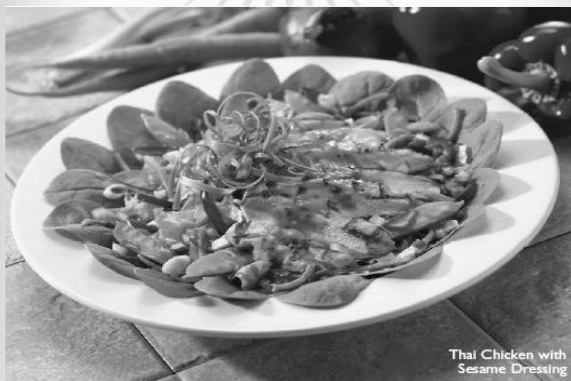
Thai Chicken with Sesame Dressing

Due to the overwhelming responses to Eating Fit!, it is now going to stay on the main menu! Enjoy the flavors of Green Mill and be true to your commitment to eat healthy. Counting fats, calories or even dietary fiber? The Green Mill Eating Fit menu features healthier alternatives — many that meet the requirements of today's most popular diets.