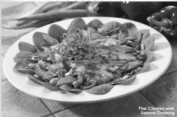
Thai Chicken with Sesame Dressing

Due to the overwhelming responses to Eating Fit, it is now going to stay on the main menu! Enjoy the flavors of Green Mill and be true to your commitment to eat healthy. Counting fats, calories or even dietary fiber? The Green Mill Eating Fit menu features healthier alternatives – many that meet the requirements of today's most popular diets.