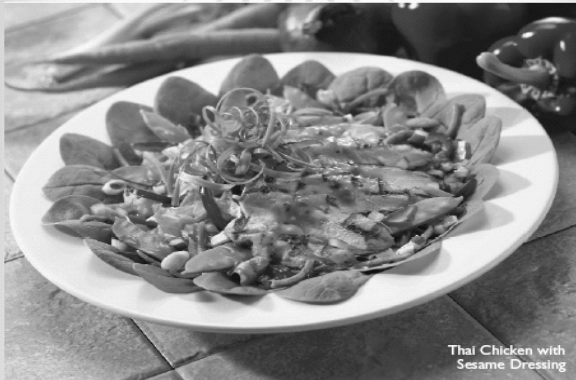
Thai Chicken with Sesame Dressing

Due to the overwhelming responses to Eating Fit, it is now going to stay on the main menu! Enjoy the flavors of Green Mill and be true to your commitment to eat healthy. Counting fats, calories or even dietary fiber? The Green Mill Eating Fit menu features healthier alternatives – many that meet the requirements of today's most popular diets.