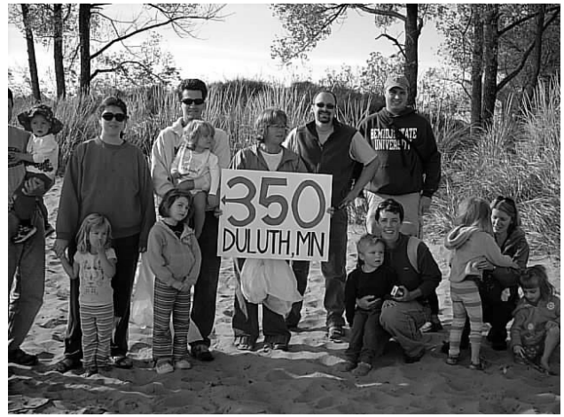
Family Beach Cleanup held on 10/10/10

A reminder to all Park Pointers, especially a certain "long time resident of Park Point". I'll be happy to print anyone's letter to the editor in the Breeze, providing they're not obscene or libelous, but they must be signed! Unsigned letters go in the circular file.