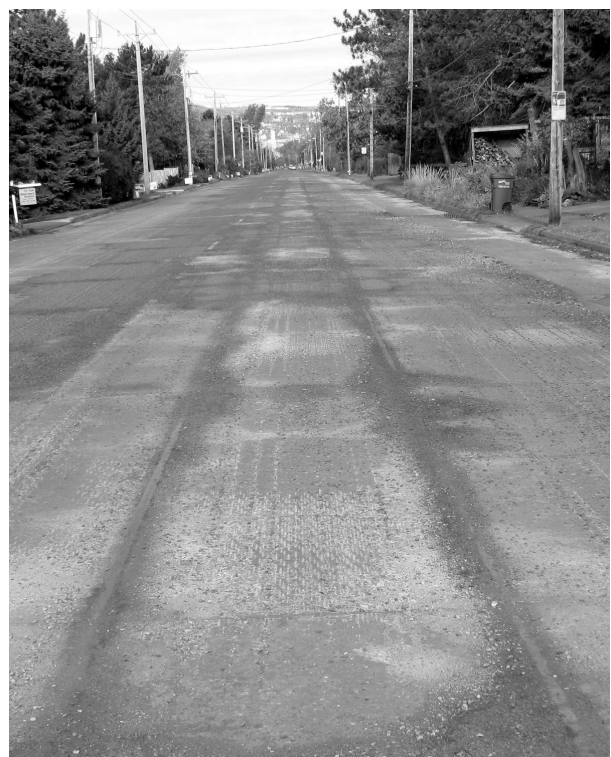
Old trolley tracks near 27 th Street were exposed during the street resurfacing.