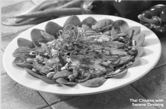
Thai Chicken with Sesame Dressing

Due to the overwhelming responses to Eating Fit, it is now going to stay on the main menu! Enjoy the flavors of Green Mill and be true to your commitment to eat healthy. Counting fats, calories or even dietary fiber? The Green Mill Eating Fit menu features healthier alternatives – many that meet the requirements of today's most popular diets.