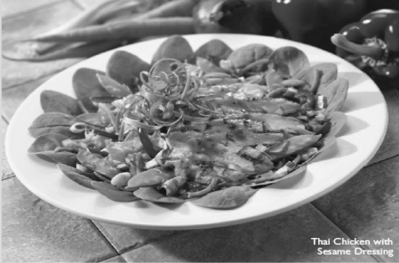
Thai Chicken with Sesame Dressing

Due to the overwhelming responses to Eating Fit, it is now going to stay on the main menu! Enjoy the flavors of Green Mill and be true to your commitment to eat healthy. Counting fats, calories or even dietary fiber? The Green Mill Eating Fit menu features healthier alternatives – many that meet the requirements of today's most popular diets.