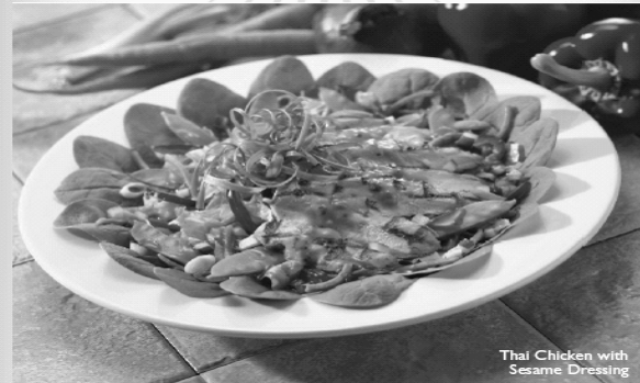
Thai Chicken with Sesame Dressing

Due to the overwhelming responses to Eating Fit!, it is now going to stay on the main menu! Enjoy the flavors of Green Mill and be true to your commitment to eat healthy. Counting fats, calories or even dietary fiber? The Green Mill Eating Fit menu features healthier alternatives – many that meet the requirements of today's most popular diets.