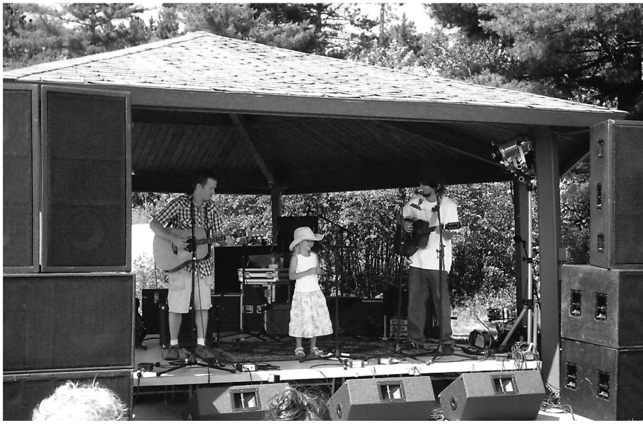
At left, The Hobo Nephews of Uncle Frank (with special guest singer) perform at the Freedom Fest

So with the Art Fair and Rummage sale behind us, as well as the Canal Park congestion of Grandma's Marathon and the fireworks crowds of the 4 th of July, you'd think things would quiet down around here. Oh no, not on Duluth's playground, otherwise known as Park Point. On July 7 th , also the date of the rowing regatta, The Park Point Recreation Area was host to the first Annual Freedom Fest. This free music festival was piggybacked onto a previously scheduled Ultimate Frisbee Tournament. This tournament is worth mentioning by itself, as it included a dozen teams from around the Midwest, but I must confess some ignorance here. Even after watching (with divided attention) for a couple hours, I still don't quite understand the rules. I was impressed with the energy and athleticism of the players, though, even in the 90 degree heat.