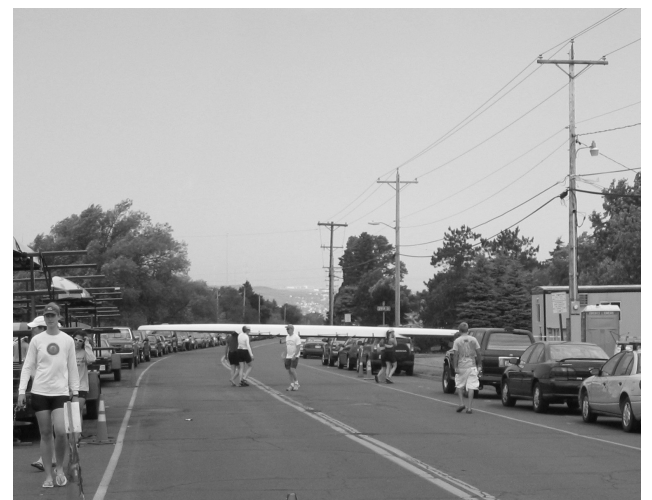
A steady stream of rowers and helpers hauled boats and gear across the street to the lake side.

The Duluth Rowing Club hosted its 48 th International Rowing Regatta on Saturday, July 8, 2006 with over 300 competitors attending in the Junior, Open, and Master's categories. The regatta was delayed in starting because of a thunderstorm rolling through the area. Due to westerly winds, the regatta was moved from the St. Louis Bay to the Lake side of Park Point. The regatta started about 10:00 a.m. with the first event.