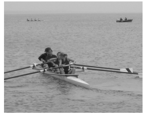
A Duluth Fours crew rows out the starting line