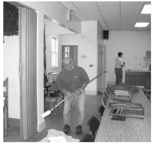
Park Point Volunteers hard at work painting the interior of Lafayette

Maybe extreme is a bit of an overstatement, but the hardworking crew of volunteers who have been cleaning and painting and fixing up things at Lafayette have made a dramatic improvement in the appearance of the building. From power washing the exterior to cleaning the kitchen, and most notably, painting the big 2 nd floor meeting room, Park Point volunteers have taken on some long overdue projects that the city has neither the money nor manpower to perform. The work is ongoing, and more Lafayette Work Days will be scheduled, and posted on the sign at the S – curve. You need not be a member of the Park Point Community Club to join in on this effort: anyone willing to join in and get their hands dirty is welcome. The initial push has been to get the meeting room ready for the summer rental season, and I invite everyone to stop and see the new color scheme. The bright white walls and deep green trim bring out the best features of the room. You might even be inspired to rent it for your next event. (It worked for me; I'll be hosting my daughter's grad party there in June) Call Barb Greene at 940-2613 for rental info.