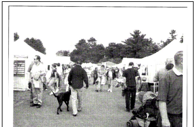
Last year's fair-goers enjoyed near perfect weather. Can we do it again?

If you volunteer to help out you'll be able to meet the whole Tamburo family at the Artist's Picnic and Awards Ceremony, held Saturday, June 25 th , at 6:00 p.m. just east of the childrens' play area on the grounds of the fair.